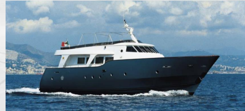
M/Y BONHEUR VI (ex Alba lady) – MM 26M