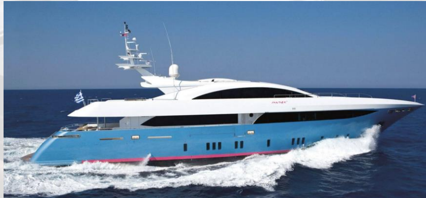
M/Y Panther – MM 41M