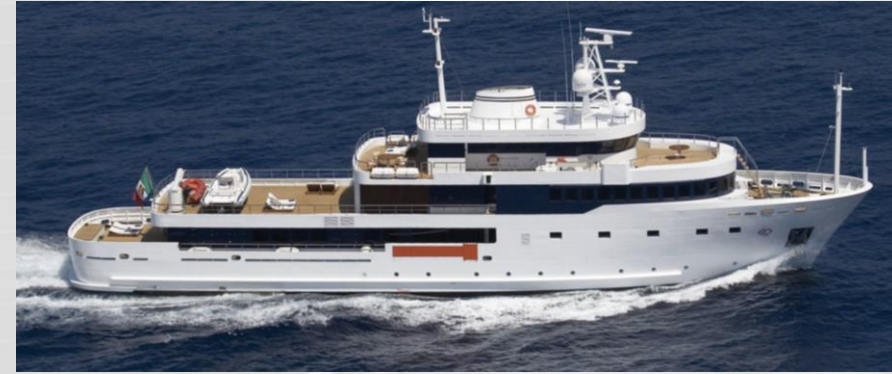
M/Y Tribù – ISA 51M