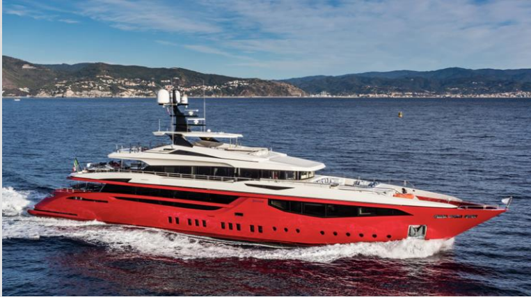
M/Y Ipanema – MM 50M

Founded in 1915, Mondomarine has delivered 34 superyachts