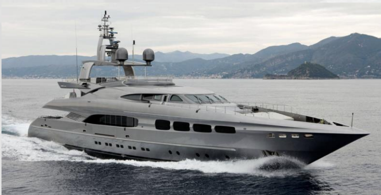
M/Y Strealine – MM 50M