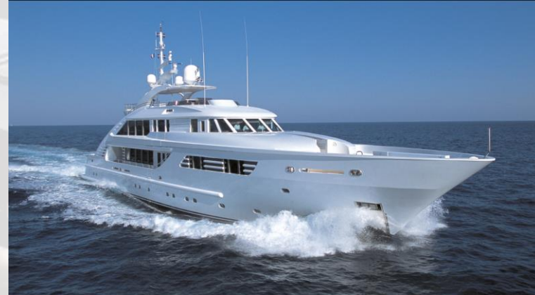
M/Y Ocean Victory – ISA 48M