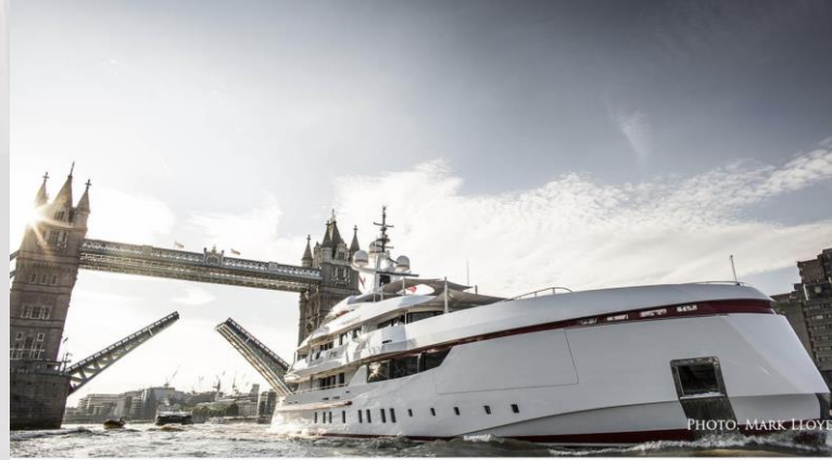
M/Y Forever One – ISA 55M