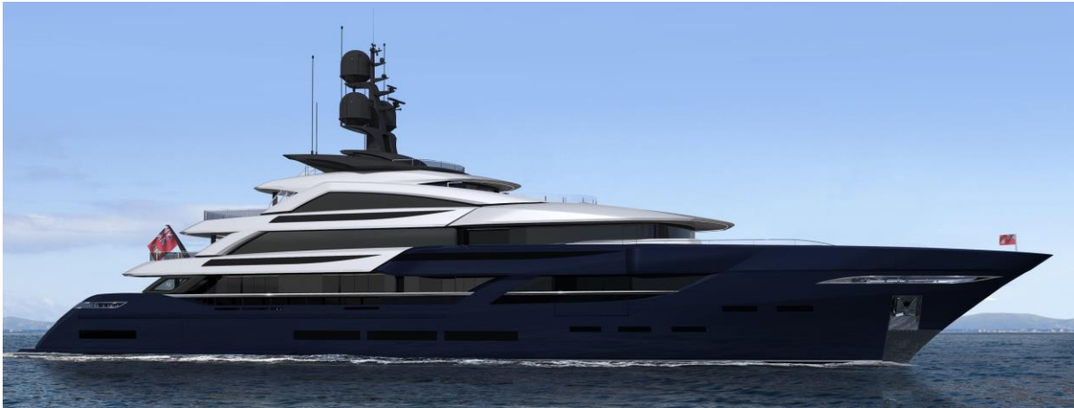
ISA CLASSIC 65M