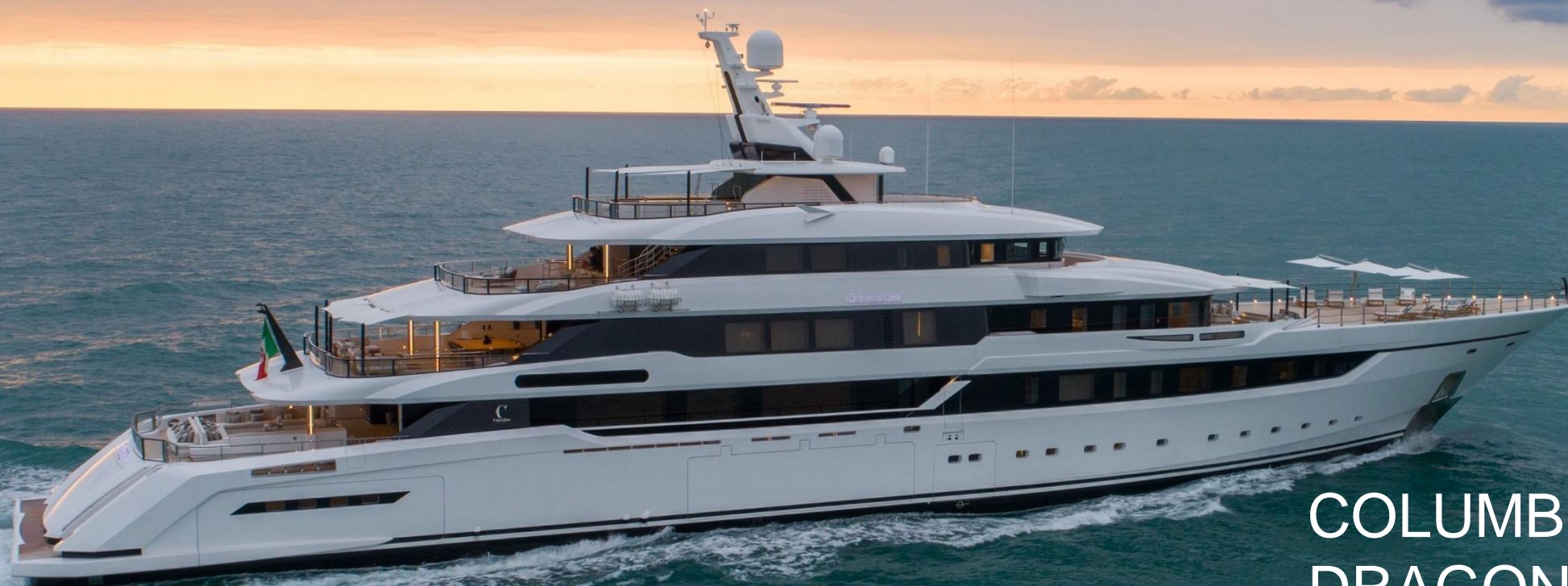
COLUMBUS 80M DRAGON