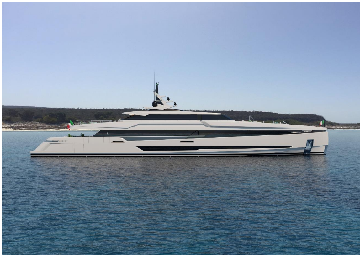
COLUMBUS SPORT 50M