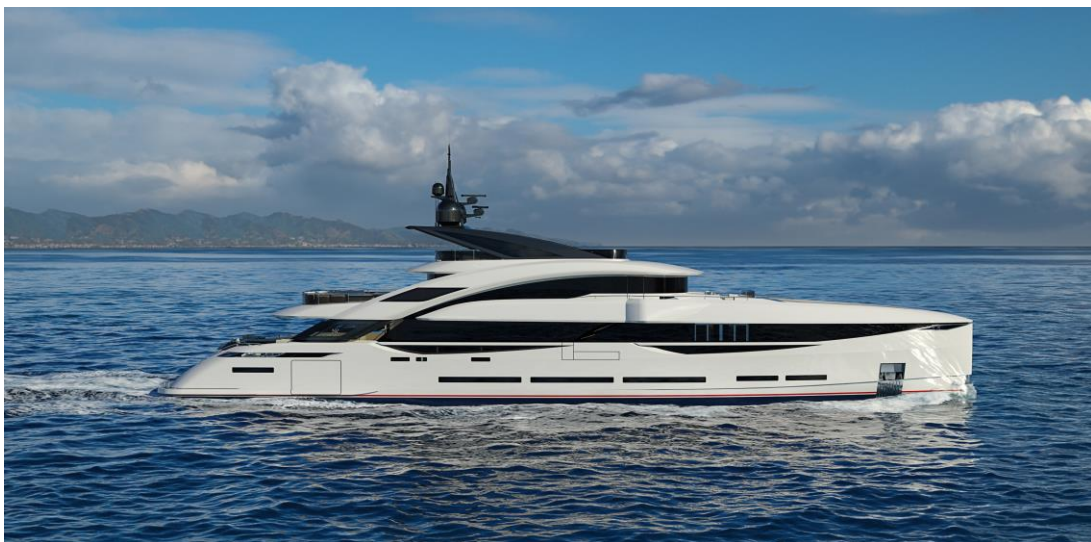
ISA GRAN TURISMO 45M