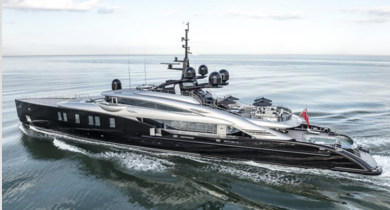
M/Y Okto – ISA 67M

Founded in 2001, Isa Yachts has delivered 32 superyachts