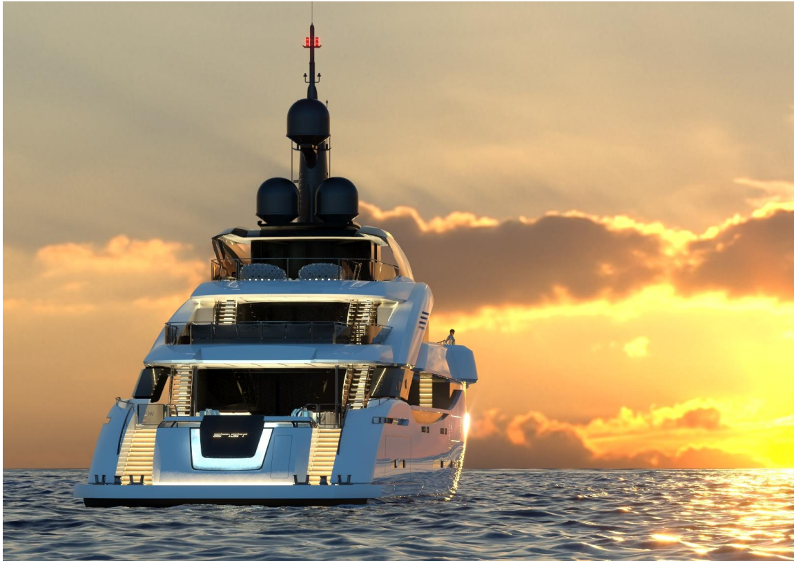
ISA GRAN TURISMO 67M