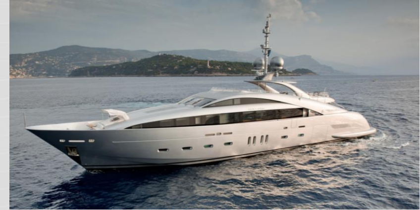
M/Y Silver Wind – ISA 43M