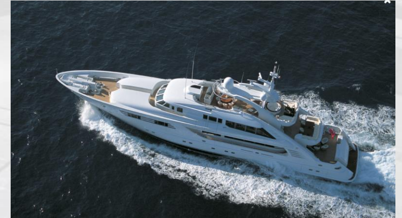
M/Y April Fool – ISA 48M