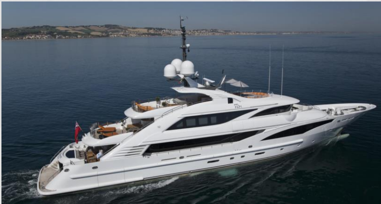
M/Y Papi du Papi – ISA 50M