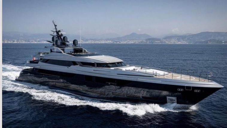
M/Y Sarastar – MM 60M